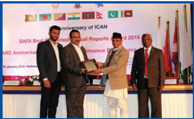
IDCOL achieved the SAFA Best Presented Annual Report Awards and SAARC Anniversary Awards for Corporate Governance Disclosures-2016 under Public Sector Entities category