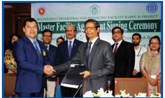
IDCOL signed Master Facility Agreements (MFA) with Bangladesh Bank on 07 August, 2018 for availing fund for Infrastructure projects under IPFF II