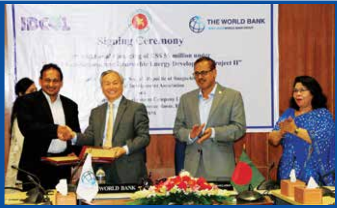
Signing Ceremony of 2nd additional financing of USD 55 million under Rural Electrification and Renewable Energy Development Project II