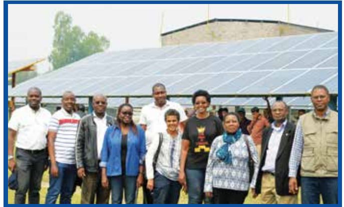
Experience Sharing Program by IDCOL for interested parties to replicate IDCOL renewable energy model