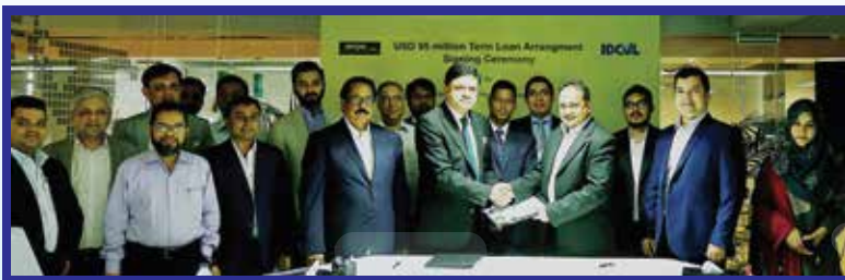
IDCOL will arrange finance for 5 power plants having combined capacity of 636MW